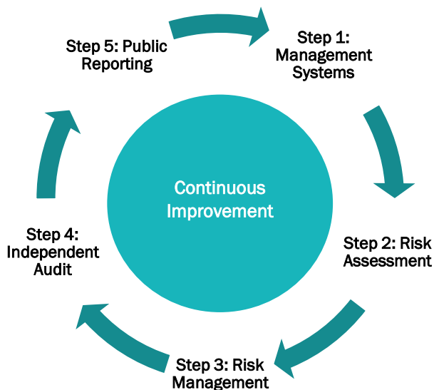
Figure 4: LBMA RGG Five-Step Due Diligence Framework